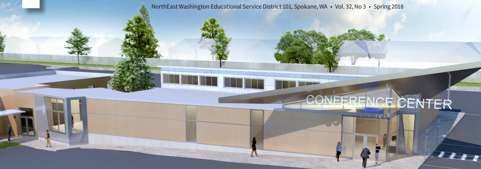
Artist's rendering of the conference center addition.

NorthEast Washington Educational Service District 101, Spokane, WA • Vol. 32, No 3 • Spring 2018