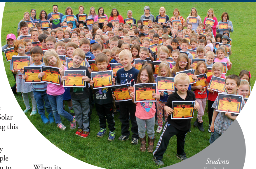
Students proudly display their “hot tickets to the sun.”

The Parker probe will fly closer to the sun than any spacecraft before it, gathering data on solar activity that ultimately affects life on earth.