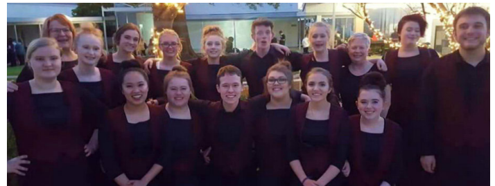
Davenport swing choir celebrates another successful California tour.